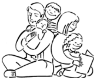
Parenting Preschoolers Faithfully